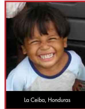
La Ceiba, Honduras